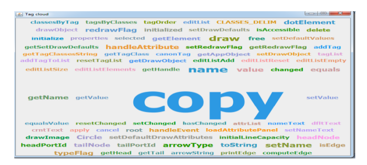
Figure 3: Tag Cloud of GRAPPA ecosystem.

The Tag cloud tool gives the general overview of the vocabularies used in the source code of the project. Figure 3 shows the Tag cloud of GRAPPA ecosystem. This tool gives the information to the developer who wants to obtain a general overview of the domain language of a project. The tag cloud tool analyses and visualizes some of the most important vocabularies used in the GRAPPA ecosystem project are 'copy', 'graph', 'subgraph'.