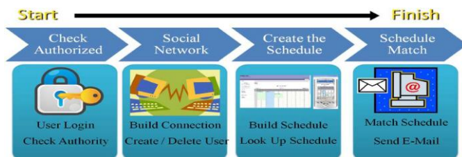
Fig. 1. Matching module.

4) Discussion platform: This platform is displayed in the form of discussion board, which can only be accessed under authorization. This arrangement ensures that a subject of discussion is only raised after the consent of all users authorized by the administrator.