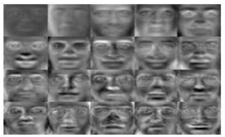
Fig 1:Image Segregation with Eigen vector