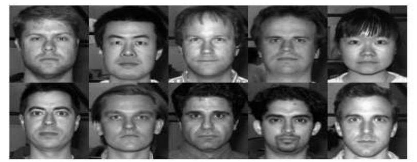
Fig 2: Sample Image from Yale Face Database B

he Yale B database used contains 386 initial PGM formats and 856 grayscale faces. [9] The resolution of the image is 168 (width) \times 192 (height) pixels. There are 31 themes in the eyeglassed light center, happy, light left, no glasses, nature, light, sad, sleepy, surprised, and wink: 31 themes for pictures, each expression of face and different shape. Sample images, by special arrangement, the file name of the image of the label in this database refers to the situation and lighting details. It is shown in Figure 2. The first part of the filename begins with the primary name "Yale-B" followed by a two-digit number followed by a two-digit number to indicate the number object and the situation. The rest of the file name deals with the azimuth and elevation directions for the direction of the individual light sources. Belong to topic 3 in the direction of the light source for the camera axis, for example the image of Yale DB. PGM visible situation 6, and the azimuth angle 35 ° (A + 0 35) and the high 40 ° (E + 40) Here, the positive azimuth indicates that the light source, which means that it was left, was on the right side of the topic, negative. The positive height is above the horizontal line and the negativeness is below the horizontal line. A complete description of the Internet's state and lighting is provided by the database. [10] The obtained image was taken with the camera Sony XC-75 with 8 bit (grayscale) (with linear response function) and stored in PGM raw format.