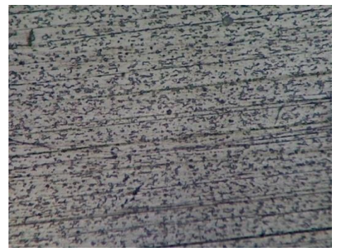
Figure 3: CircularManipulation