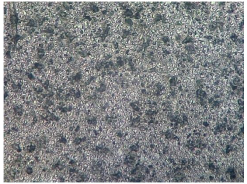
Figure 4: ZigzagManipulation