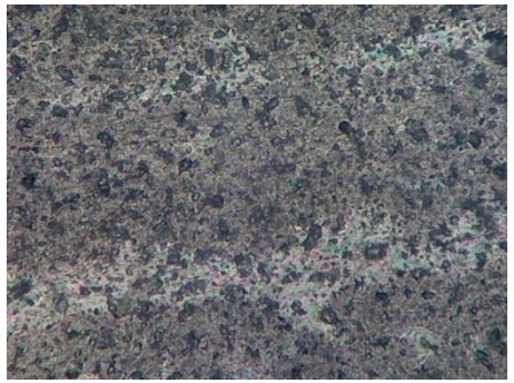
Figure 2: StraightManipulation

Figure 1 shows the microstructure of welded zone with straight manipulation of electrode. Figure 2 shows the microstructure of welded zone with circular manipulation of electrode. Figure 3 shows the microstructure of welded zone with Zigzag manipulation of electrode.