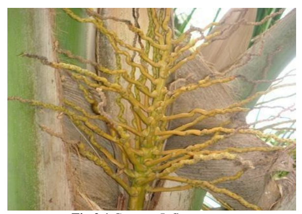
Fig.2.1 Coconut Inflorescence

An Inflorescence is a group or cluster of flowers arranged on a stem that is composed of a main branch or a complicated arrangement of branches. Morphologically, it is the part of the shoot of seed plants where flowers are formed and which is accordingly modified. The modifications can involve the length and the nature of the Internodes and the phyllotaxis, as well as variations in the proportions, compressions, swellings, adnations, connations and reduction of main and secondary axes. Inflorescence can also be defined as the reproductive portion of a plant that bears a cluster of flowers in a specific pattern. The stem holding the whole inflorescence is called a peduncle and the main stem holding the flowers or more branches within the inflorescence is called the rachis. The stalk of each single flower is called a pedicel. The fruiting stage of an inflorescence is known as an infructescence. A flowerthatisnotpartofaninflorescenceiscalleda solitar flower and its stalk is also referred to as a peduncle. Any flower in an inflorescence may be referred to as a floret, especially when the individual flowers are particularly small and borne in a tight cluster, such as in a pseudanthium.