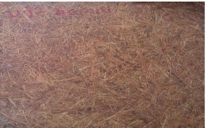
Fig 9.1: Fabrication of Fiber Plates.

Fiber plates are made by using compression moulding process. Required dimension of fiber plates are 270mm square and thickness of 3mm.