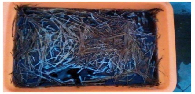
Fig.5.1 Chemical Treatment of Coconut Inflorescence

The extracted fibers are to be chemically treated with NaOH for making the surface of the fiber rougher such that bonding will be better during composite fabrication. In this work the fibers were treated with 5% of NaOH. The chemical treatment erodes the material from the fiber. The chemical treatment erodes the cellulose, lignin and waxcontents.