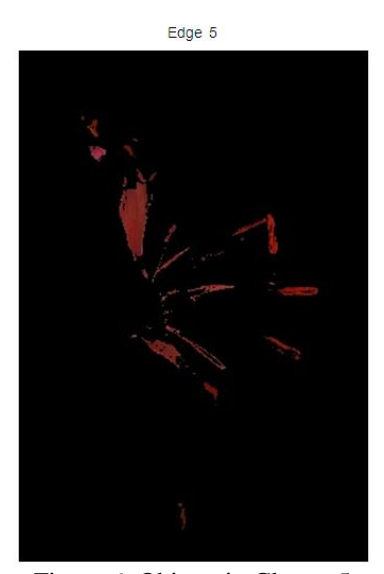
Figure 6: Objects in Cluster 5

Figure 5 shows most concentrated part of this image in the form of a cluster.