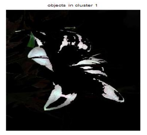
Figure 2: Objects in Cluster 1