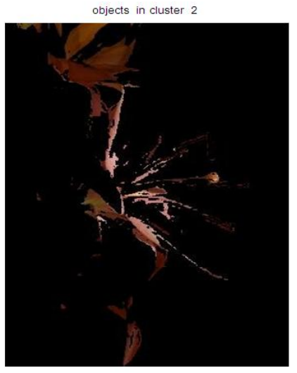
Figure 3: Objects in Cluster 2