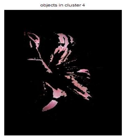
Figure 5: Objects in Cluster 4

Figure 5 shows most concentrated part of this image in the form of a cluster.