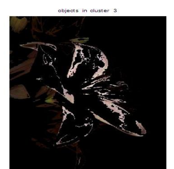
Figure 4: Objects in Cluster 3