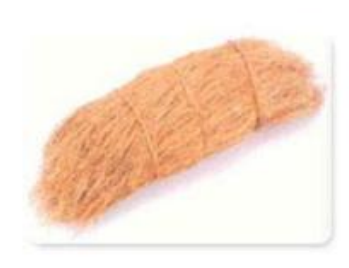
Figure 1. Coconut tree, coconut and coconut fibres.