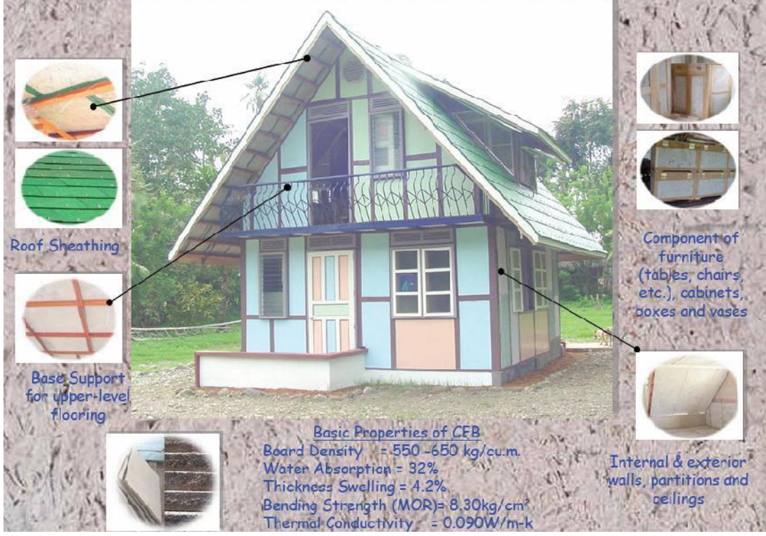
Figure 4. Applications of coconut fibre boards in house construction and other utilities (Luisito et al., 2005).