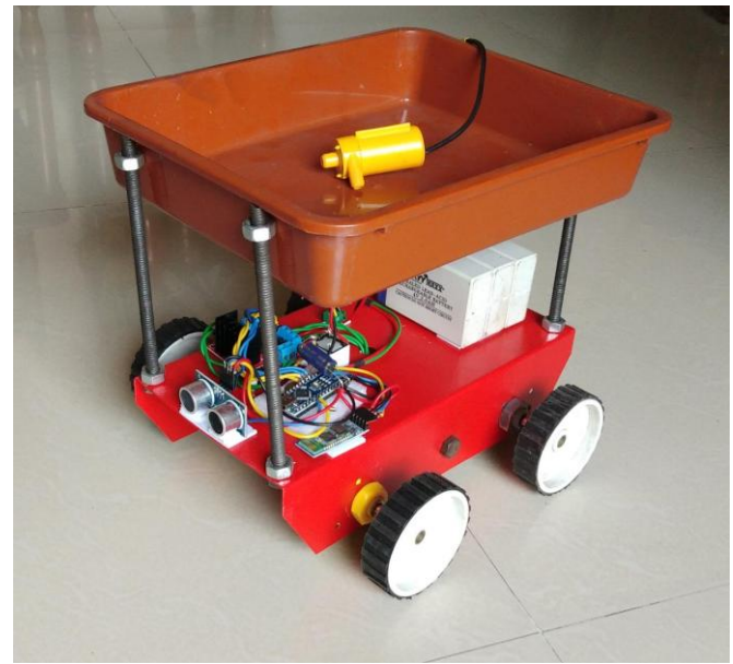
Fig 3. Self Balancing Robot for Medical Emergency