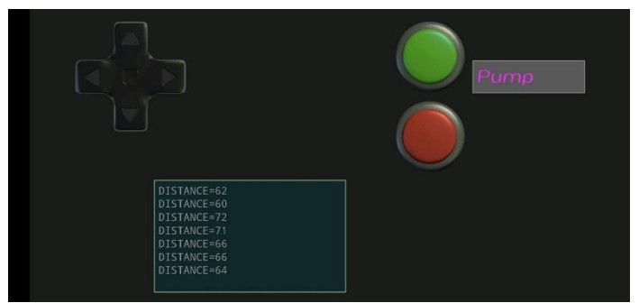
Fig 4. Operating System on Mobile

When the robot moves TO and DOWN freely it shows nonstop variation of distance in the terminal.