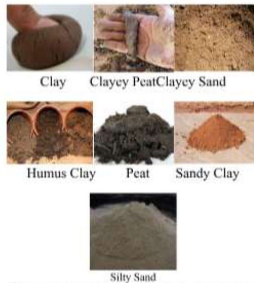
Fig. 2 Images of the collected soil samples

Conventional methods of soil classification included manual methods such as Standard Penetration Test (SPT) [6], Cone Penetration Test (CPT) [7], Pressure Meter Test (PMT) [8], and Vane Shear Test (VST)[9]; while some advanced methods included Constraint Clustering and Classification (CONCC) and Boundary energy method. The most recent method of soil classification is by using image processing with the help of SVM classifier [10]. SVM classifier in image processing extracts the features of image and then labels the detected images into separate classes on the basis of similarity of extracted feature from the test image with its training database.