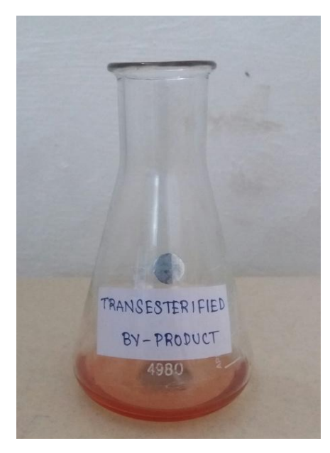
Plate: 1 Production of Biodiesel Table: 1 Characteristics of Biodiesel