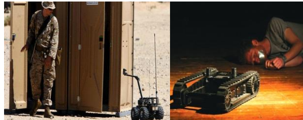
Fig .1: Military Applications

Mobile robot's play important role in military matter, dealing with potential explosives. "With suitable sensors and cameras to perform different missions, mobile robots are operated remotely for reconnaissance patrol and relay back video images to an operator.