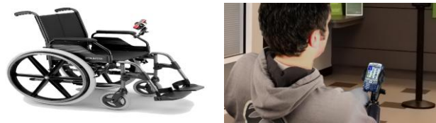
Fig.3: Wheel chair Applications

Based on our project the robot is controlled by giving a voice commands though android mobile. We can move wheel easily giving direction commands to android without hand movement.