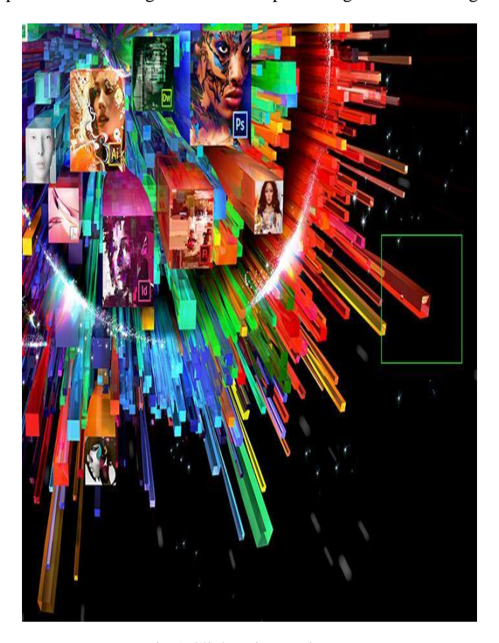
Fig 1.Click Point per image

more challenging. As shown in Figure 1, each click is directing the user to the next image, in effect leading users down a "path" as they click on their sequence of points. A wrong click leads down an incorrect path, with an explicit indication of authentication failure only after the final click. In the proposed system, users click one point on each of 5 images rather than clicking on five points on one image. A wrong click leads down an incorrect path, with an explicit indication of authentication failure only after the final click. Users can choose their images only to the extent that their click-point dictates the next image. If they dislike the resulting images, they could create a new password involving different click-points to get different images.