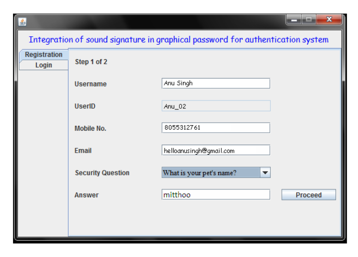
Fig 3.Registration Step 1

This is the registration form which shows that the userID is given by the system itself.