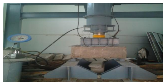
Figure 2. Test setup for Deep beam

In experimental investigation of deep beam we have taken same size of deep beam of total length 700 mm , depth 400 mm and width 150 mm. which were casted in concrete technology labarotaty and curring was carried out for 28 days . M25 gread of concrete were used for deep beam. For application of load we have used 1000 kN capacity hydraulic heavy testing machine. To measure deflection dial gauge where placed at central position of bottom of deep beam. to measure strain along mid span we have used strain gauge at equally spacing from top to bottom.