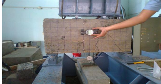
Figure 3. Strain measurement of deep beam