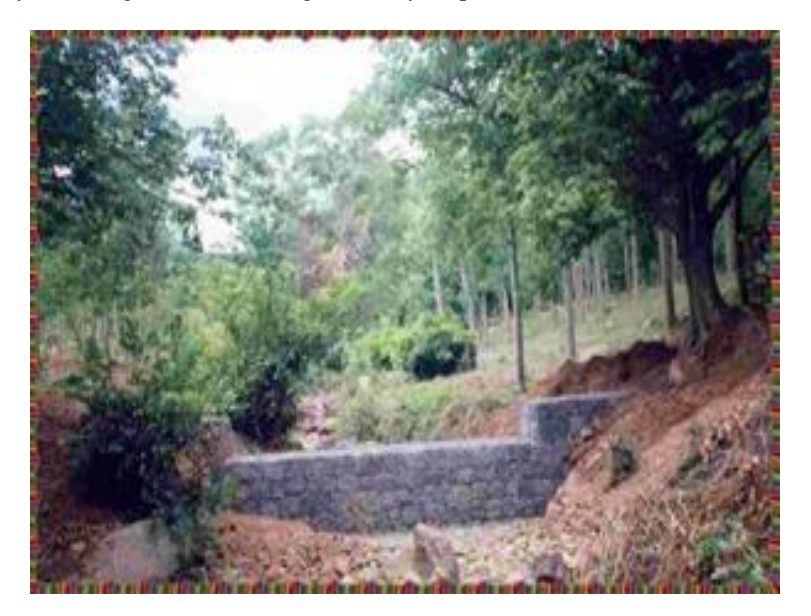
Fig-2: A Process of Irrigation

Irrigation planning either in an individual project or in a basin, as a whole should take into account the irritability of land, cost effective irrigation options possible from all available sources (including traditional ones). Wherever water is scarce, if economically advantageous, deficit irrigation may be practiced.