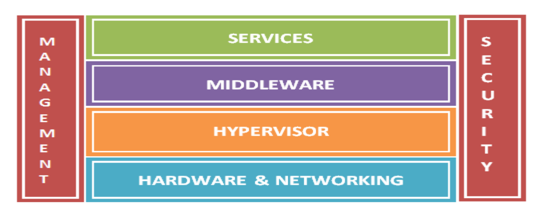
Figure 1: cloud architectural blocks