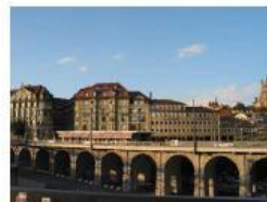
Fig. 2 Secret Image [2]