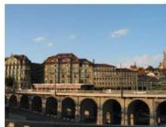
Fig. 5 Reconstruction of shares [2]