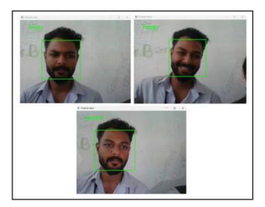
Fig2. Emotion Detection